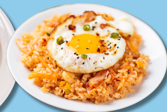
KIMCHEE FRIED RICE