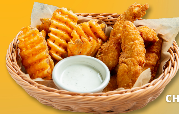
CHICKEN STRIP BASKET