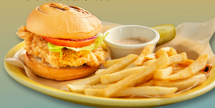
CHICKEN SANDWICH (FRIED)

Sauces: Ranch, Honey Mustard, Buffalo, Chipotle, or Garlic Parmesan Extra Sauce: $1.00