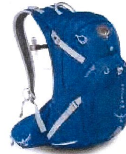
20-30 L Pack w/hipbelt