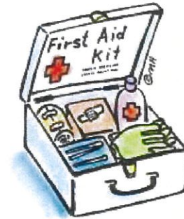
First Aid Items